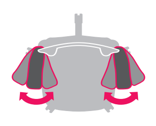
Arm Height Lever on base of arm support

To raise or lower arm: While seated, lift lever to unlock. Grasp base of arm support and raise or lower to desired height. Lower lever to lock.